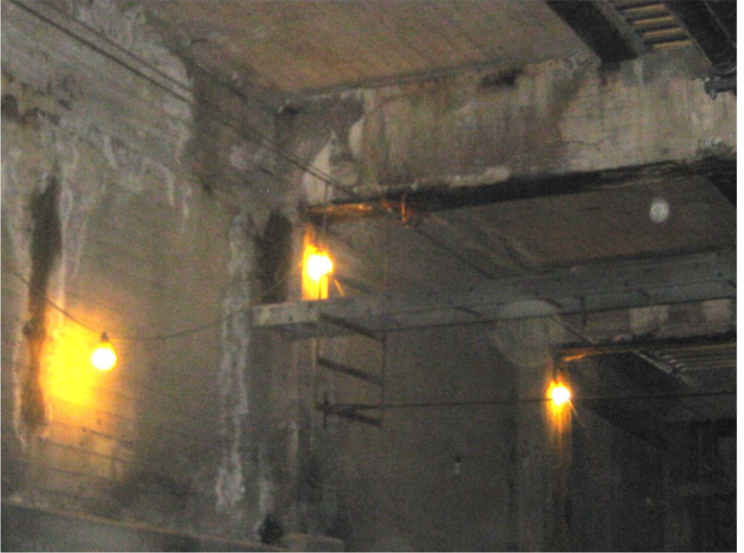
Cable Supported Staging Access Left & Right of Center Platform