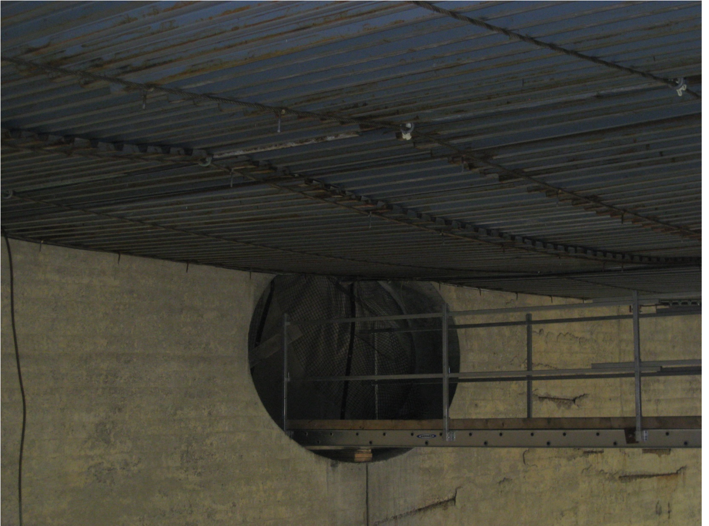
Cable/Metal Deck Platform Below Upper Roadway And Containment in The Background