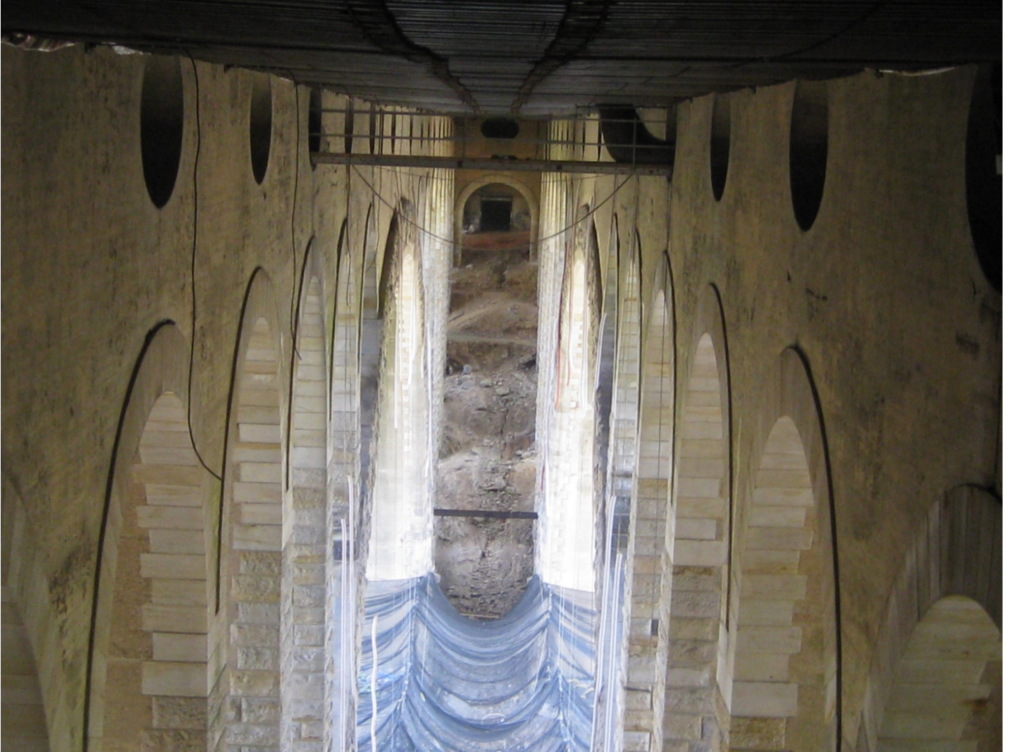
Center Cable/Metal Deck Platform Below Upper Roadway