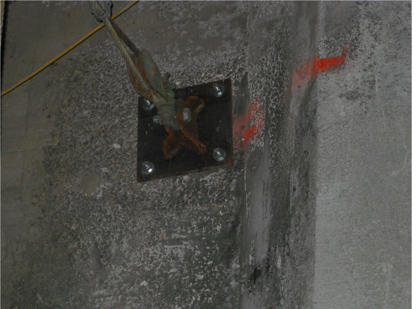
Anchor Plate End Support Assembly Main Cables