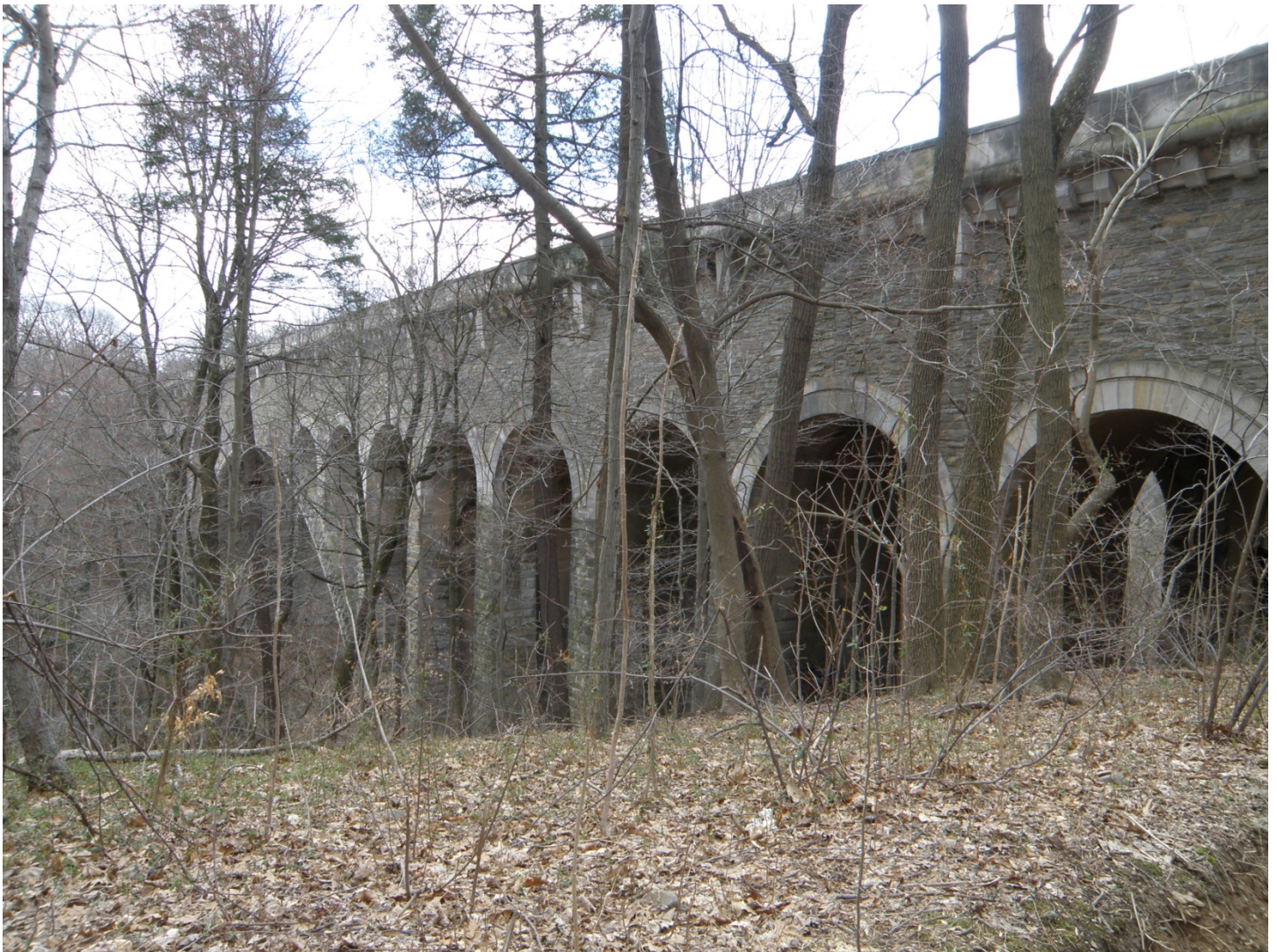
Stone Faced Concrete Arch Bridge

PROJECT DESCRIPTION: Concrete & Steel Repairs, & Blasting & Painting Project