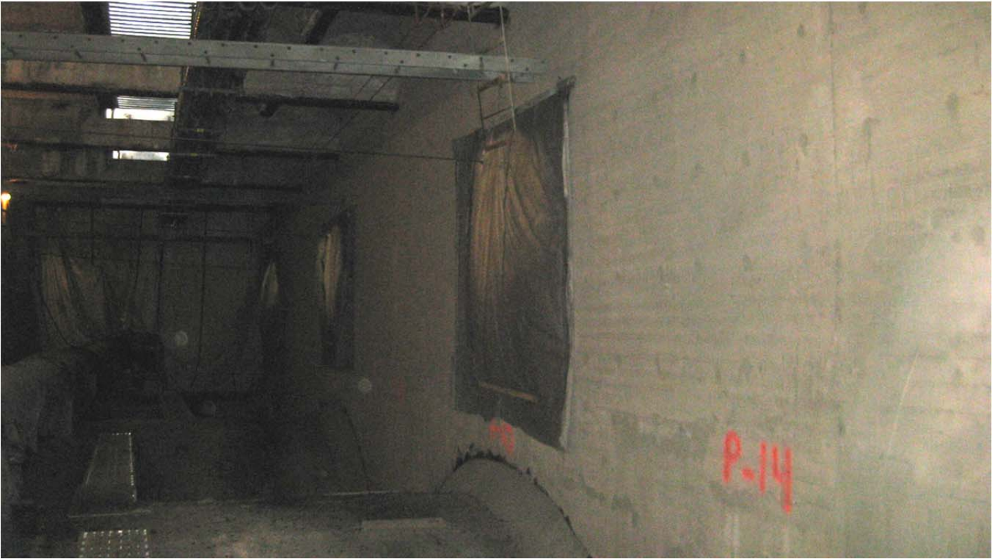
Cable Supported Staging Access Left & Right of Center Platform w/ Side Containment & End Containment In The Background