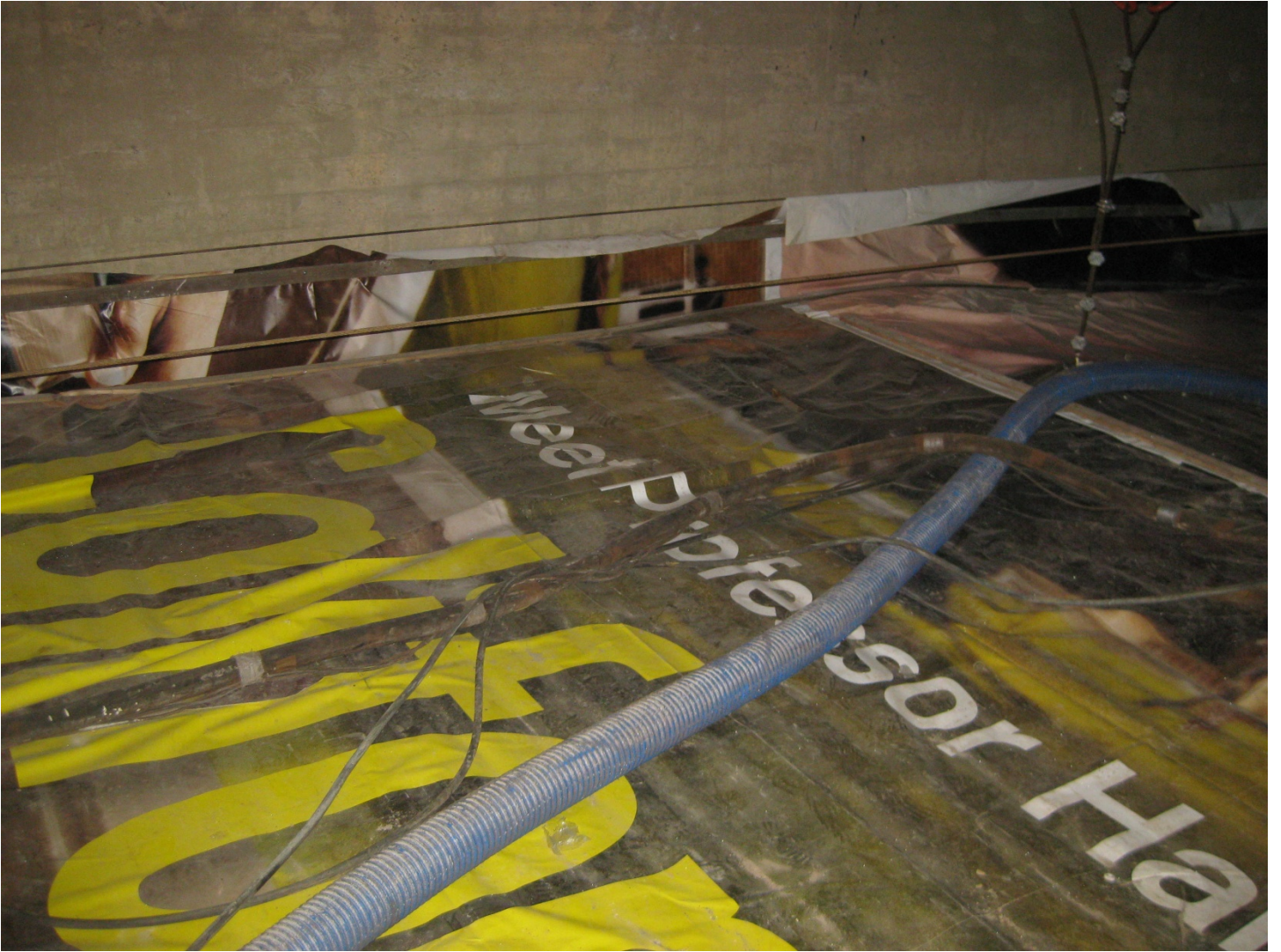
Cable/Metal Deck Platform And Containment Floor