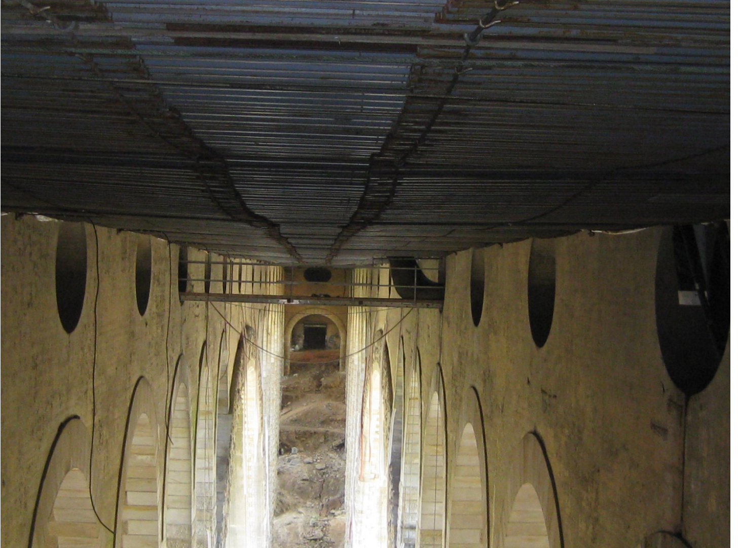
Center Cable/Metal Deck Platform Below Upper Roadway