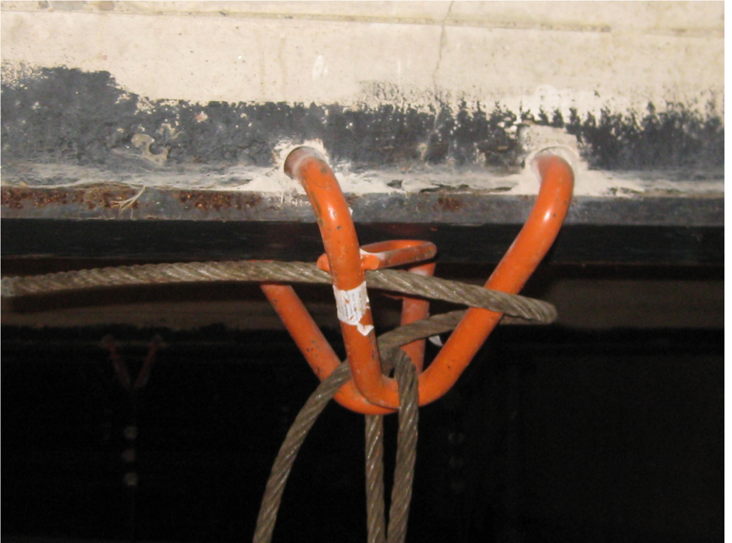
Intermediate Beam Flange Clamp Hanger Tie Up Cable Support Assembly