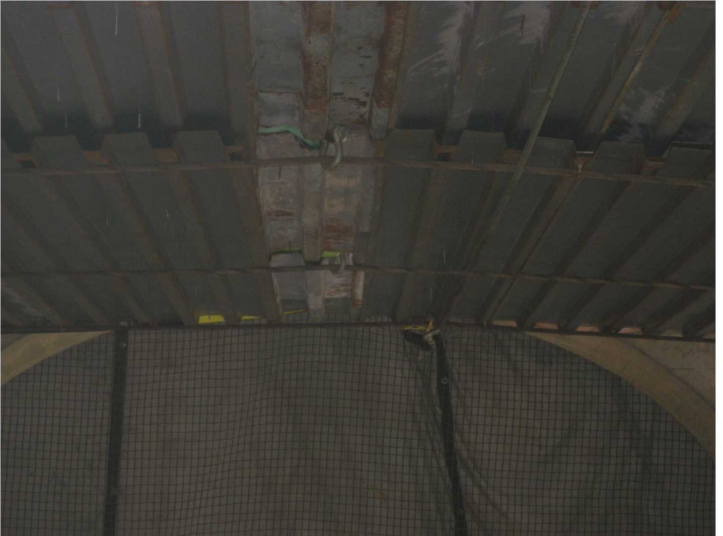
Cable/Metal Deck Platform Below Upper Roadway And Containment in The Background